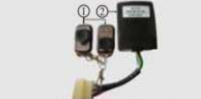
Remote controller / ATS sensor